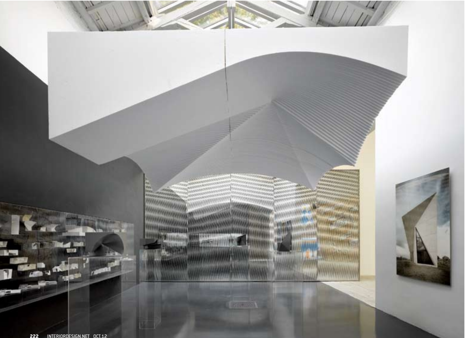
SANCHO-MADRIDEJOS ARCHITECTURE OFFICE Its cardboard, aluminum, steel, glass, and thermoplastic sculpture in the Spanish Pavilion.