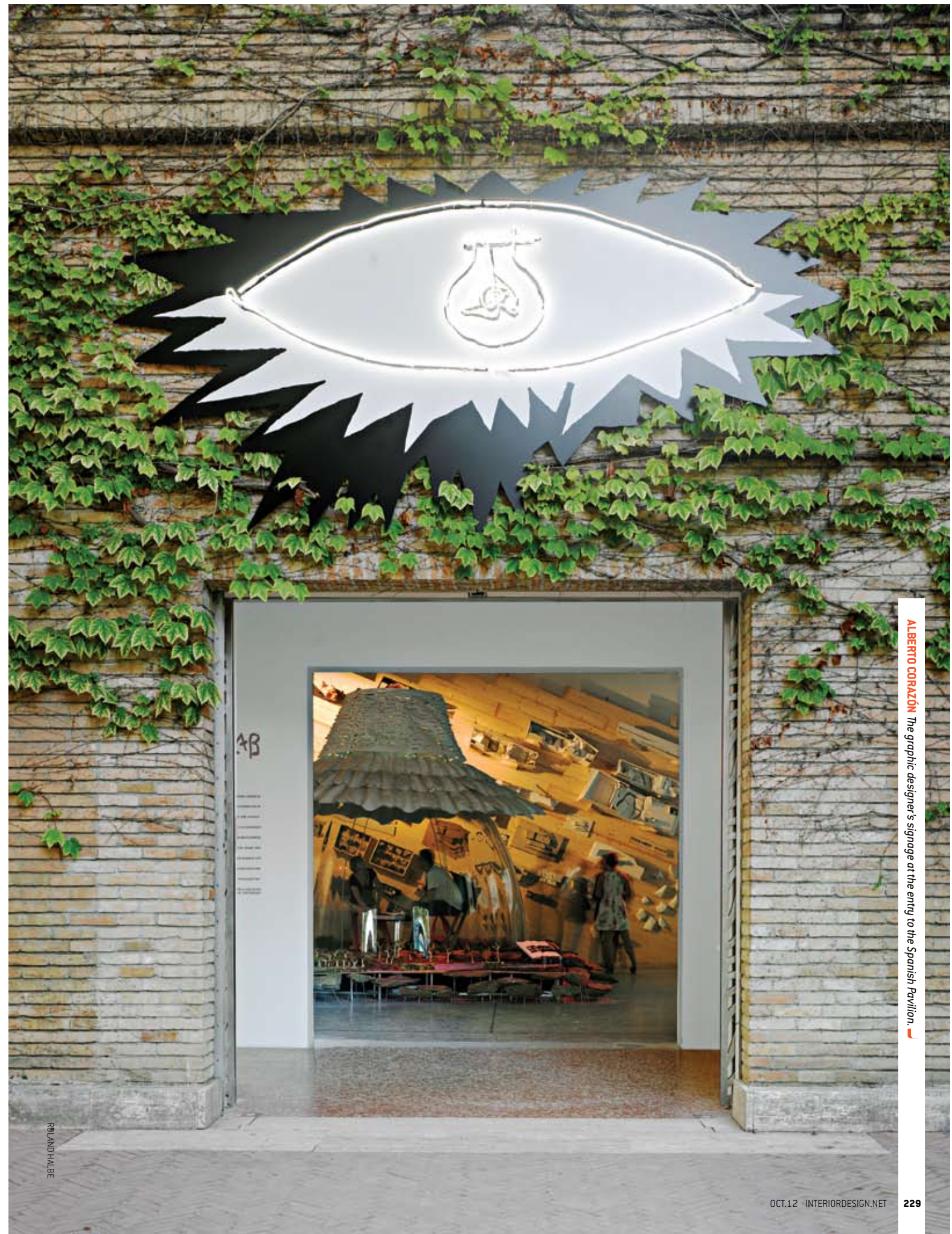
ALBERTO CORAZÓN The graphic designer's signage at the entry to the Spanish Pavilion.