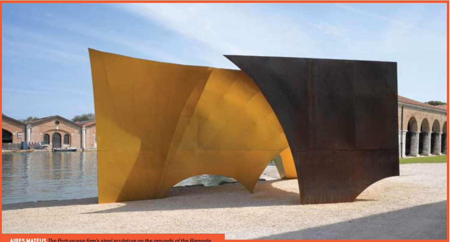
AIRES MATEUS The Portuguese firm's steel sculpture on the grounds of the Biennale.