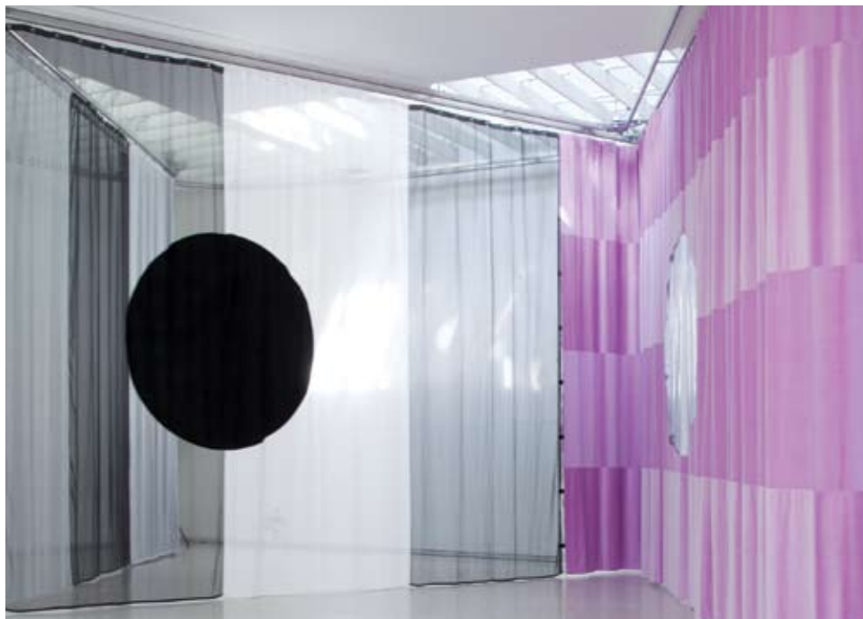
INSIDE OUTSIDE Computer-controlled curtains at the Dutch Pavilion, a structure originally designed by Gerrit Rietveld.