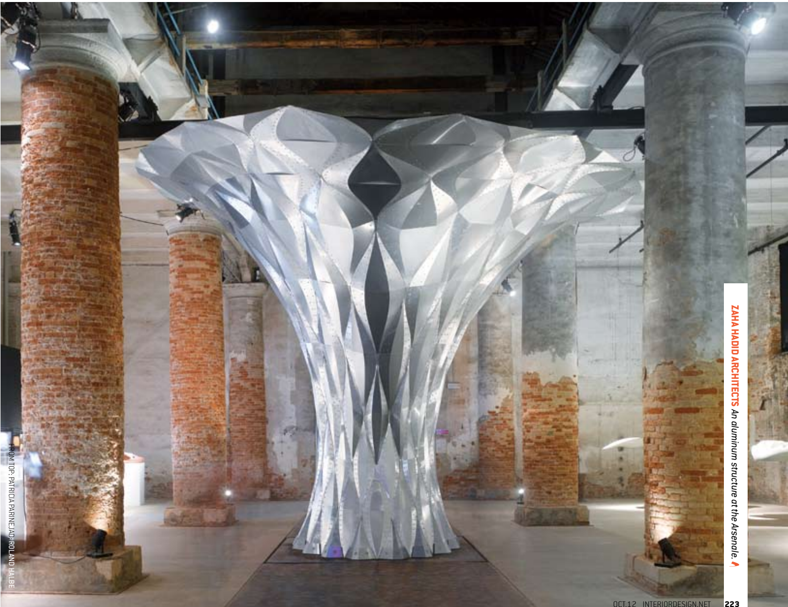
ZAHA HADID ARCHITECTS An aluminum structure at the Arsenale.