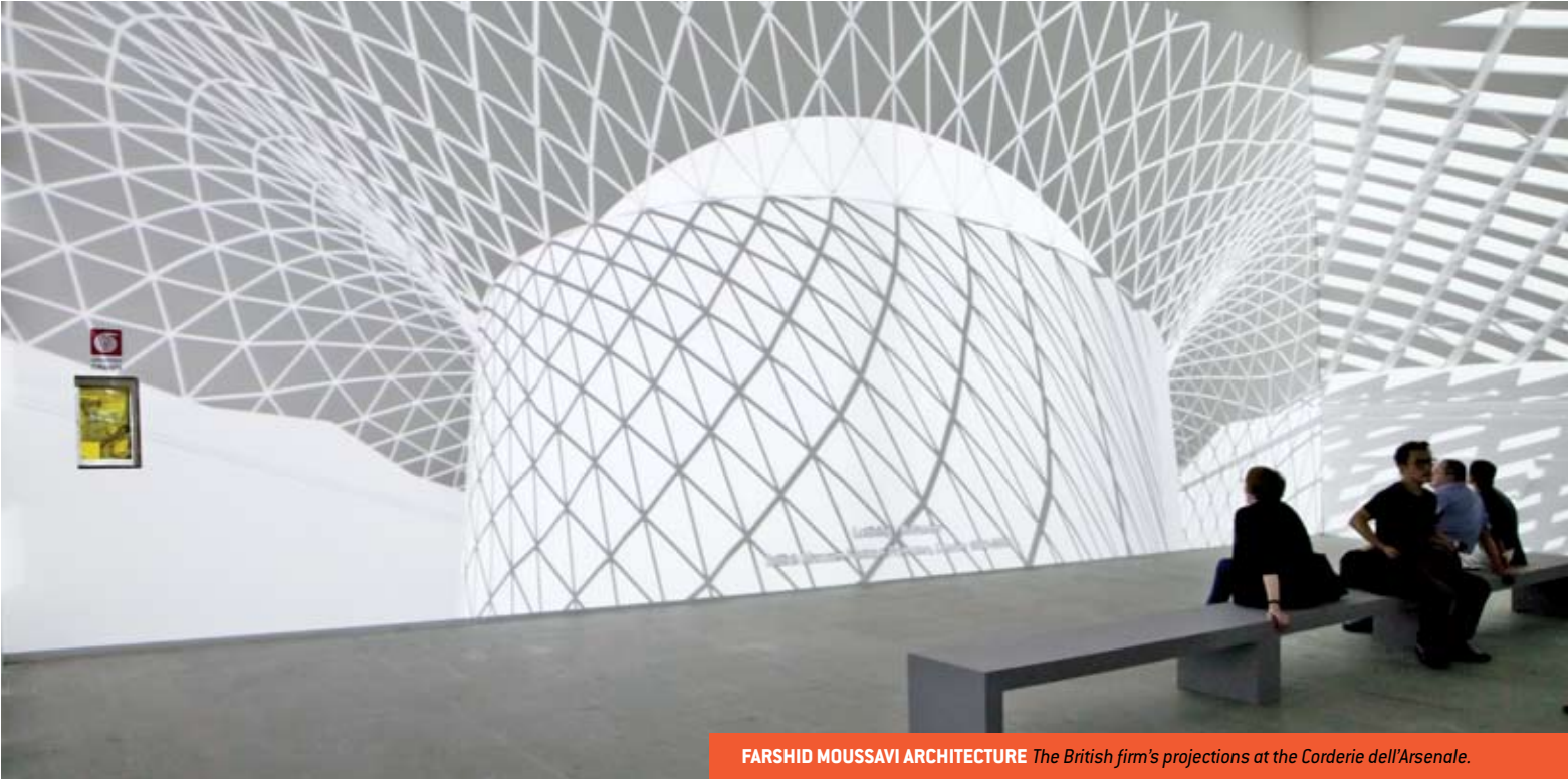
FARSHID MOUSSAVI ARCHITECTURE The British firm's projections at the Corderie dell'Arsenale.