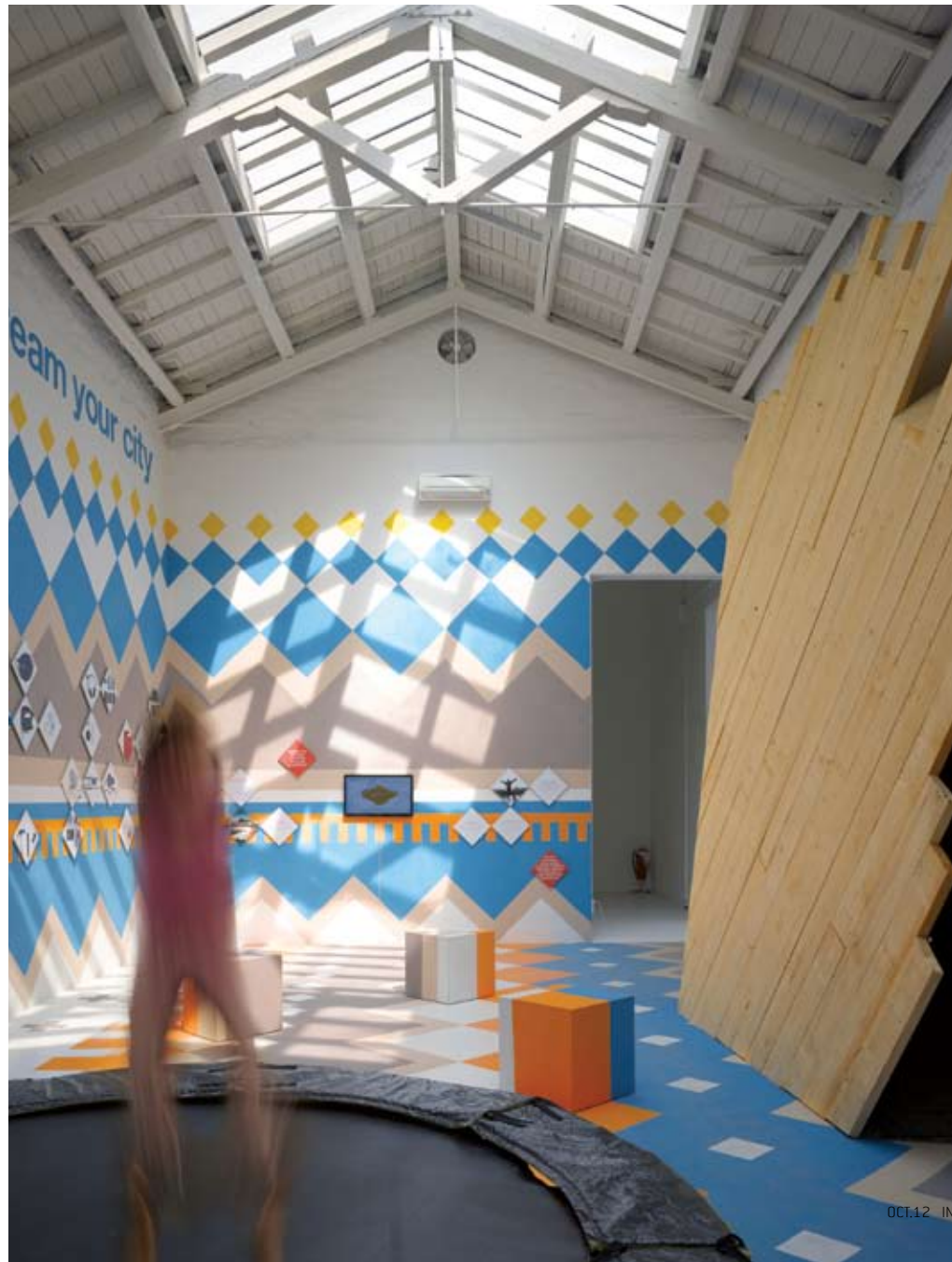
ECOSISTEMA URBANO The collective's room-size representation of its completed projects in the Spanish Pavilion. ➔