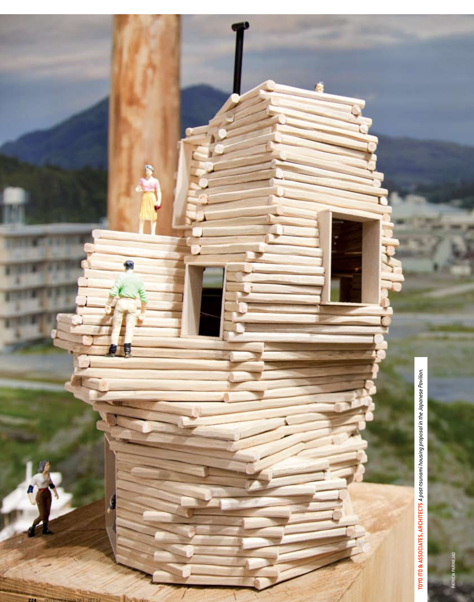
TOYO ITO & ASSOCIATES, ARCHITECTS A post-tsunami housing proposal in the Japanese Pavilion.