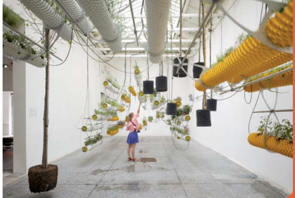
SELGASCANO An installation of recycled-plastic hydroponic planters in the Spanish Pavilion.