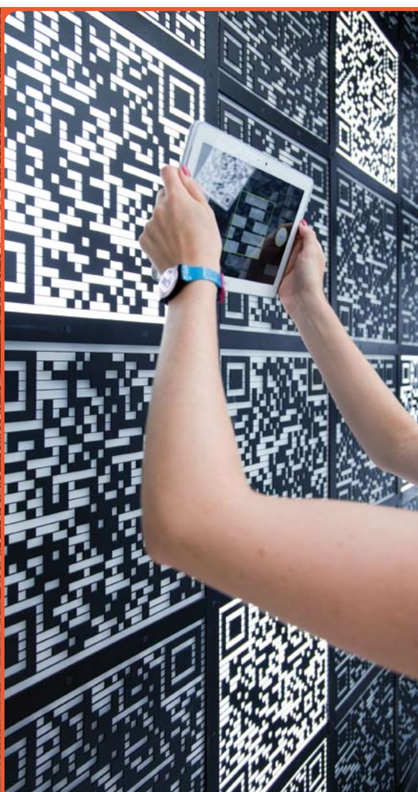
SPEECH TCHOBAN & KUZNETSOV QR-code tiles lining the interior of the Russian Pavilion. ➤